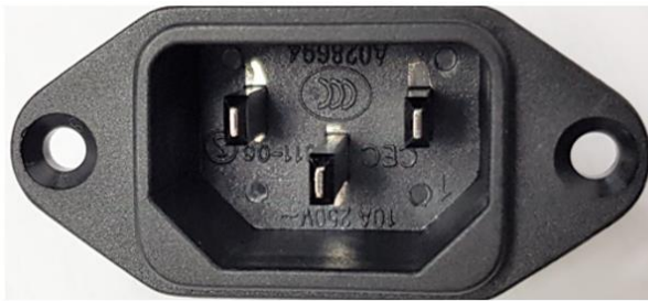
Figure 1: Old socket appearance

To introduce an equivalent (second source) inlet C14.